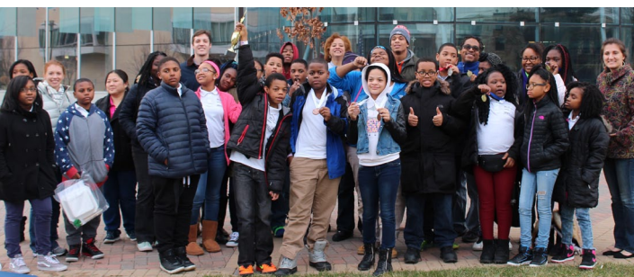
UMB CURE SCHOLARS AND MENTORS CELEBRATE AFTER SCIENCE OLYMPIAD.