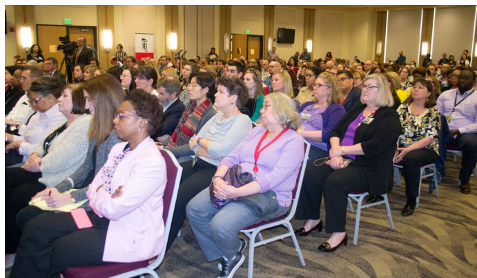
A PACKED HOUSE LISTENS TO THE STRATEGIC PARTNERSHIP ACT PRESENTATION.